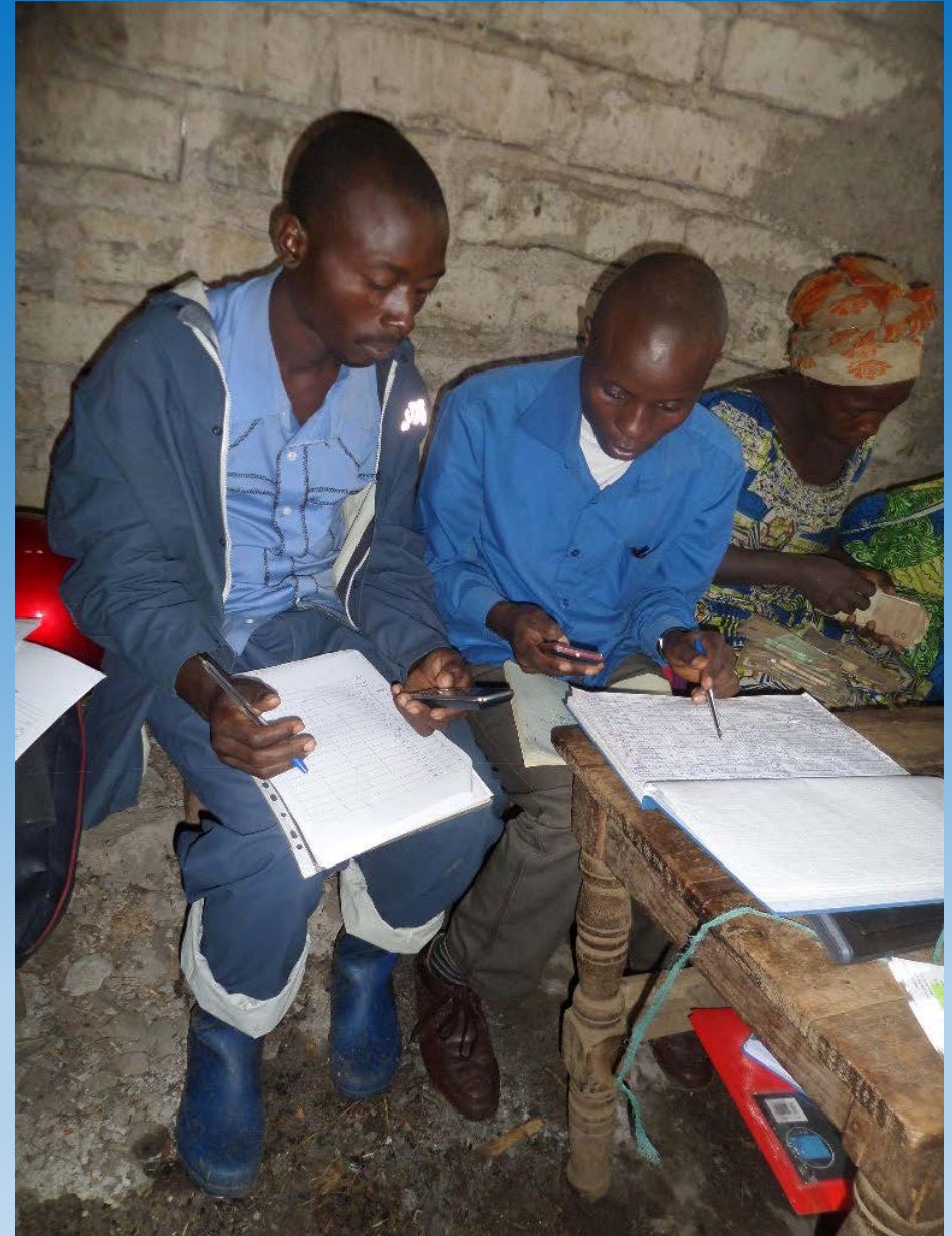
Group sending their share out information