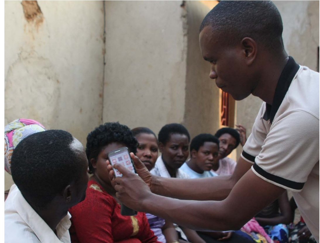
Staff training a group in e-recording